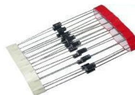
Fig. 8: diodes