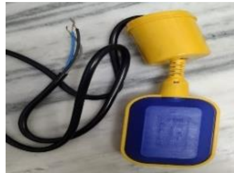
Fig.2: Float Switch Sensor