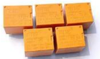
Fig. 4: 12 V Relay