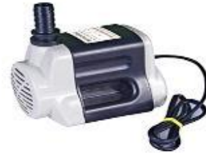
Fig.1: Water Pump