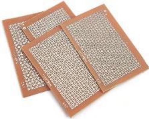
Fig.11: Breadboard PCB

grid of holes for inserting components and metal strips for connectivity.