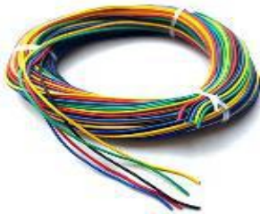
Fig. 12: Wire

12. Wire: A wire is a flexible metallic conductor as shown in Fig. 12, especially one made of copper, usually insulated, and used to carry electric current in a circuit.