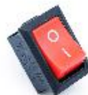
Fig. 10: Switch