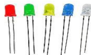
Fig.3: LED 3V