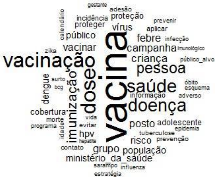
Fig.3 - Word cloud of the text corpus. Fortaleza-Ceará-Brazil, 2017