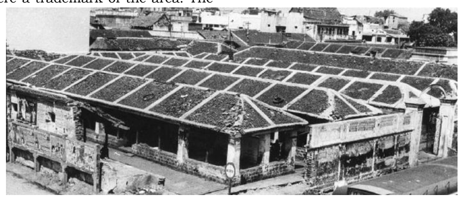
Fig.3: Chintadripet Architecture

aesthetic came from the community's requirements to weave, requiring a specific block of space for the same. Similarly, in Figure 4, there is a representation of the weavers in c. 1860, where the town planning to create open spaces for spinning and weaving was taken into consideration. Kumar called this a colonial attempt "which provided opportunities for the indigenous population to advance both their individual interest and that of their caste" (39) while maintaining ample profits for the British coffers.