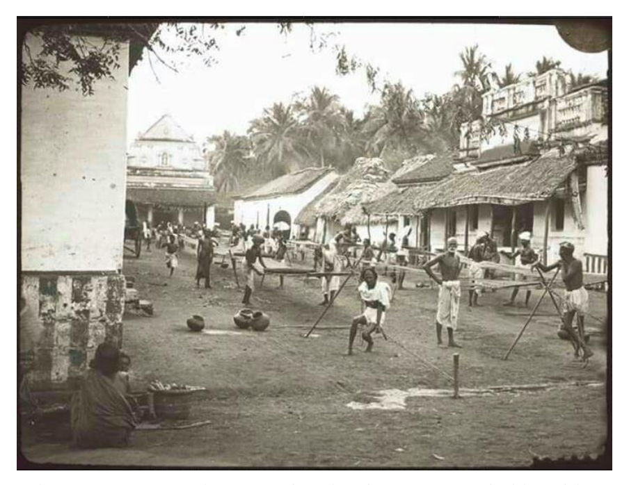
Fig.4: Open Spaces in Town Planning for Weavers of Chintadripet

In a similar vein, the aesthetic of the areas designated by the British as 'Dhoby