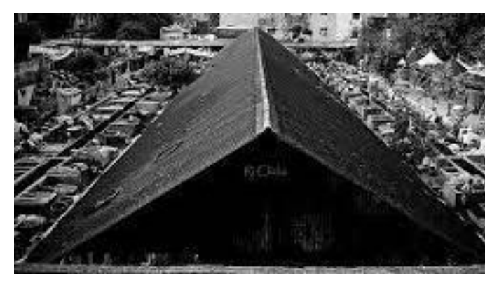
Fig.5: The Chetpet Colony in Madras

washermen to offer laundry services to the British, had a peculiar style of planning and architecture. Under the command of Sir George Moore, the area's aesthetic consisted of sloping structures that acted as washing stones, parallel-running drains, small square segments for each washerman to work, and open spaces running with clotheslines for drying. The area only experienced a renovation in the early 1980s when the government allocated more space to them in the form of rooms and terraces (Parthasarthy). As seen in Figure 5, the cramped spaces allocated for the washermen to work were immediately followed by residential dwellings. In aesthetic of such colonies overcrowding and dirt became a part, the natives became the service providers to the colonizers and dependent on being the 'other' who would engage in manual labour. Makhijani observed this as a construct that "served to reinforce a system of subjugation" (Makhijani 274) which led to the legitimization of a socio-political hierarchy of the British over the natives, thereby viewing Indians as 'inferior' subjects in the postcolonial discourse.