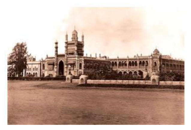
Fig.6: Chepauk Palace in Madras

practices of the Indians. Nevertheless, to one's surprise, we come across the facade of the Indo-Saracenic style of construction being propagated by them. The belief that "everything great in architecture had already been established" was perpetuated, undermining the Indian aesthetic (Panicker 30). However, creating an Indo-Saracenic style of architecture promised power to empire that waning. an was Hence, appropriating the local culture to legitimize the Crown's rule was what brought about the aesthetic. Looking at Figures 6 and 7 of the Chepauk Palace and Madras High Court, one can establish the Indianness of the appropriated aesthetic- the architectural features like the domes, minarets, jaalis, and arched gateways accompanied by the European use of lime plaster as in the White Town, steel, poured concrete, and iron bars (Sheeba et al. 1737). Such was the aesthetic of appropriation where the colonizers marginalized and 'othered' the natives yet used their socio-religious principles of architectural designs to legitimize colonialism.